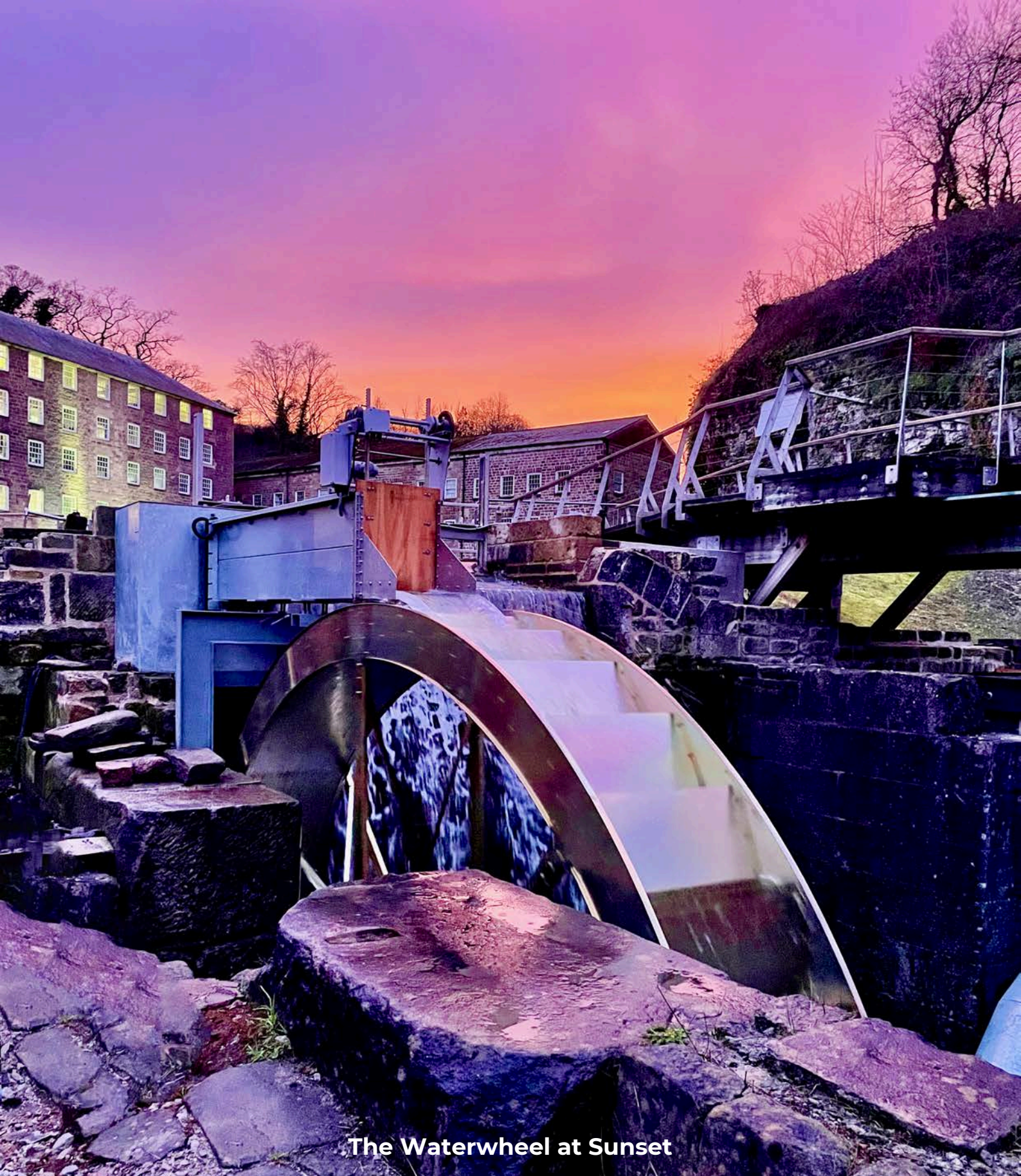
The Waterwheel at Sunset