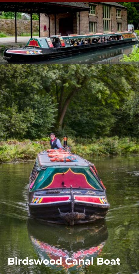
Birdswood Canal Boat