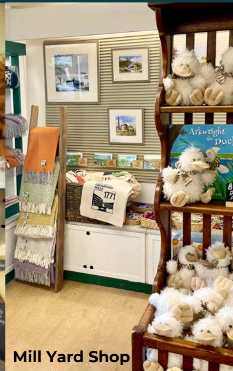
Mill Yard Shop