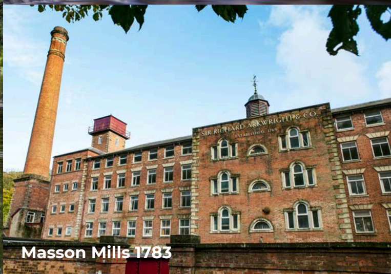
Masson Mills 1783