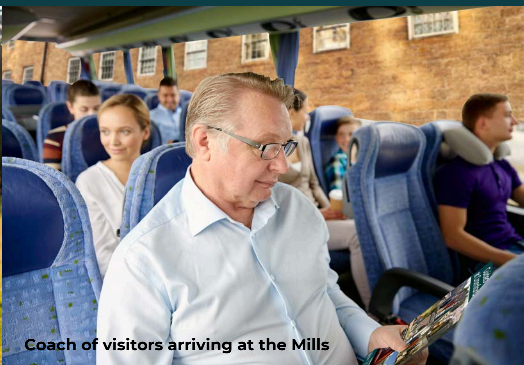
Coach of visitors arriving at the Mills