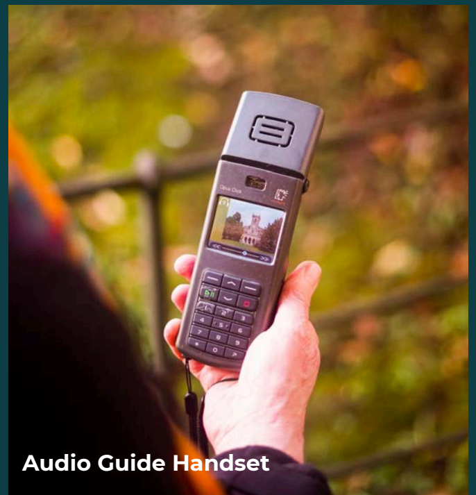
Audio Guide Handset