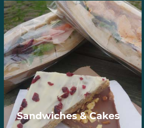
Sandwiches & Cakes

We are very fortunate to have two immensely popular cafes on site. Arkwright's café is situated within the historical Cromford Mills yard and Wheatcroft's Wharf is alongside the picturesque Cromford Canal. Both offer seasonal dishes made with locally sourced ingredients.