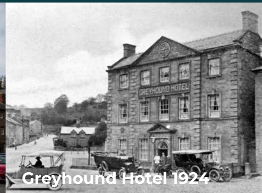
Greyhound Hotel 1924