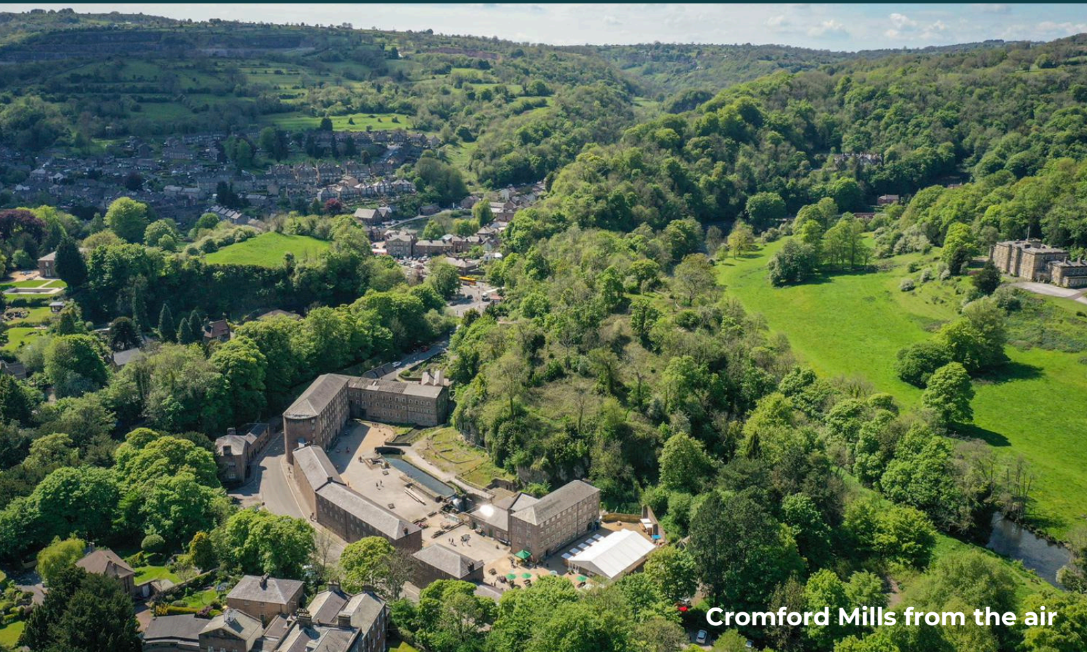
Cromford Mills from the air