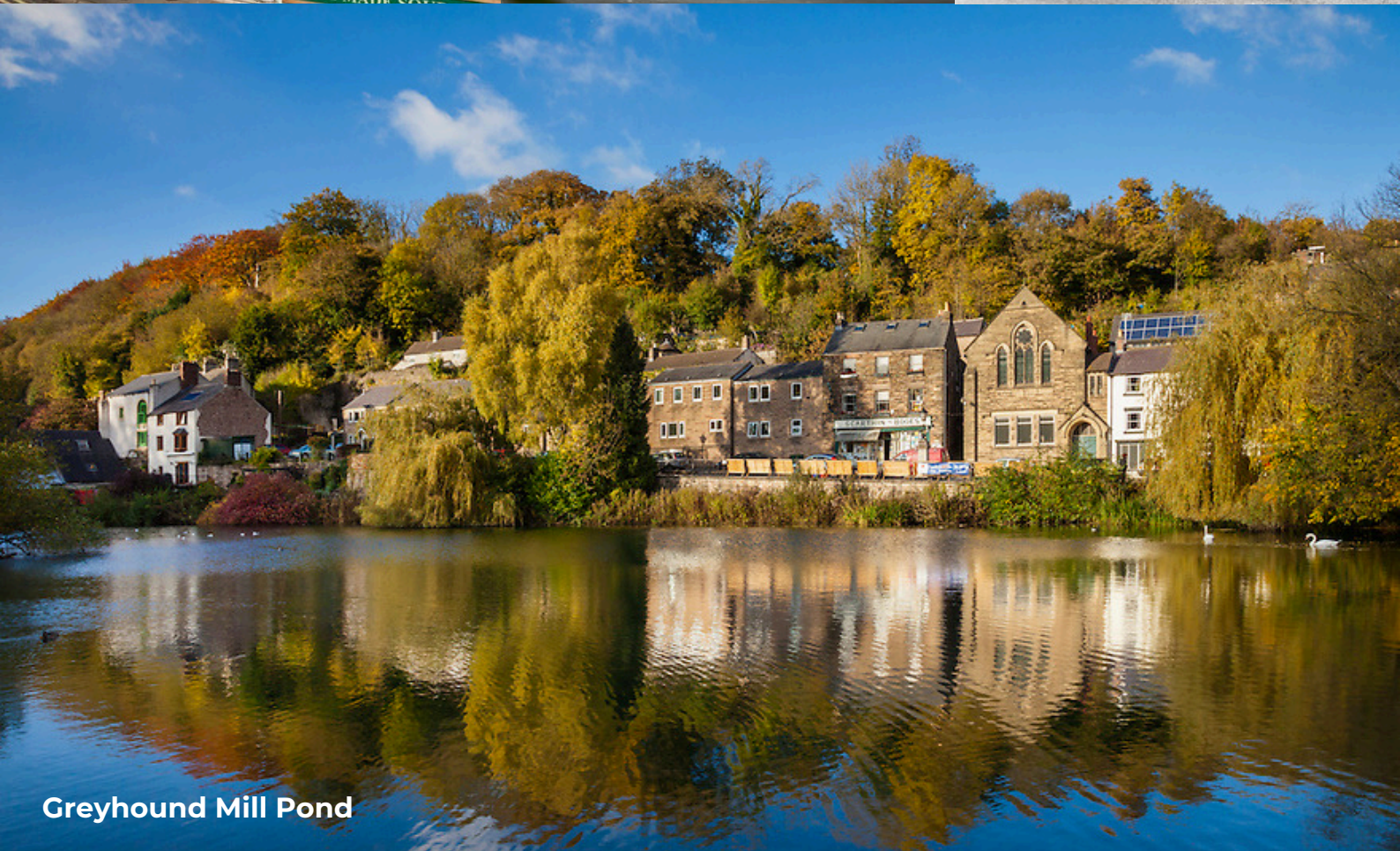
Greyhound Mill Pond