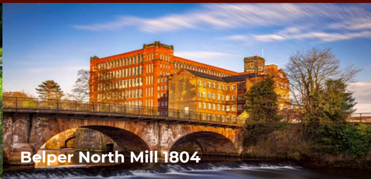
Belper North Mill 1804