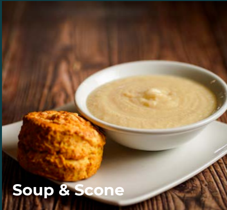
Soup & Scone